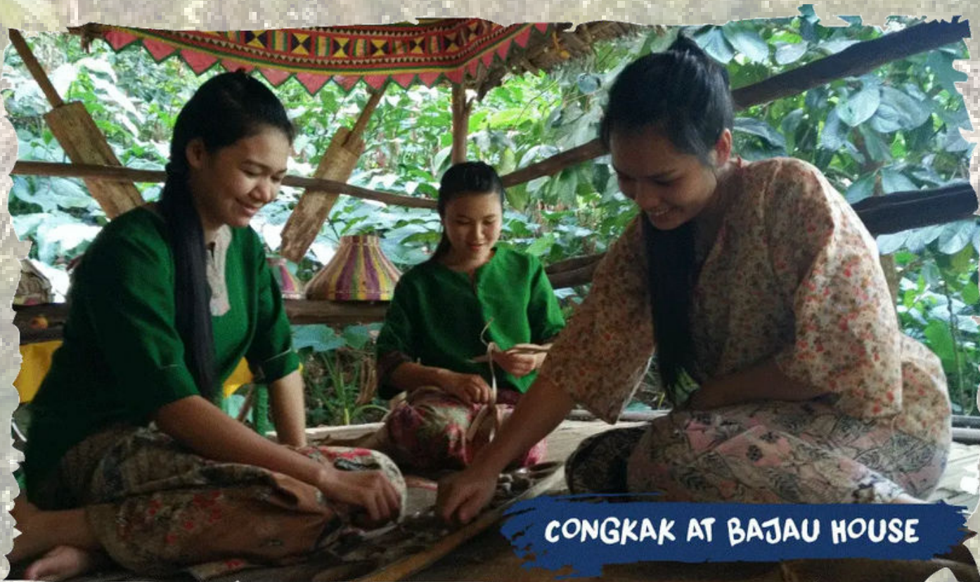
CONGKAK AT BAJAU HOUSE