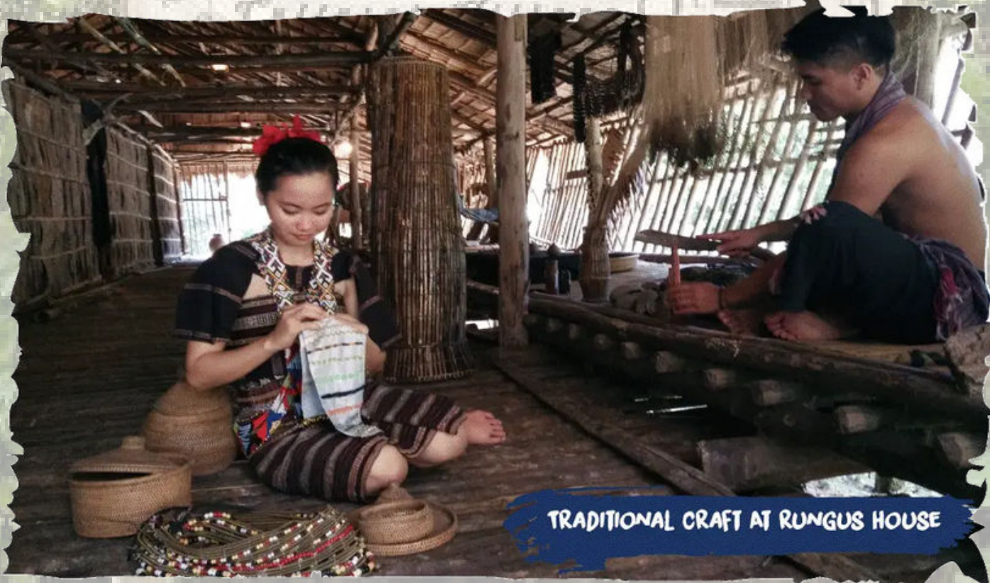
TRADITIONAL CRAFT AT RUNGUS HOUSE