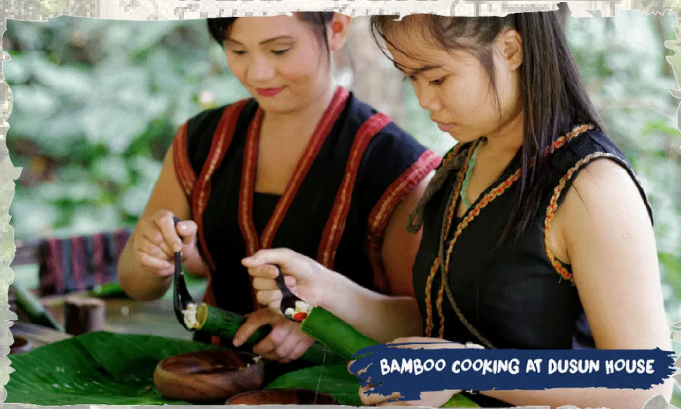
BAMBOO COOKING AT DUSUN HOUSE