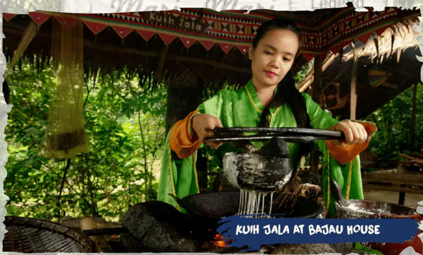
KUIH JALA AT BAJAU HOUSE